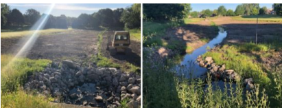
The Final Product !