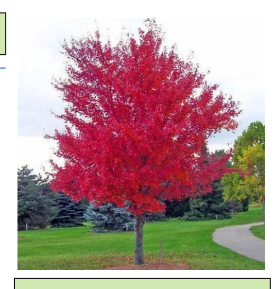
There's a new tree in the North Park